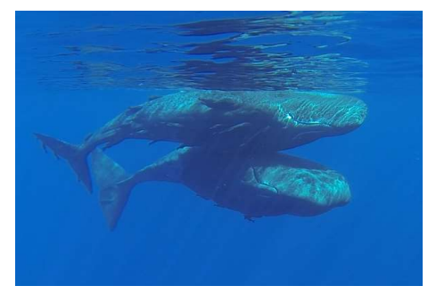
Figure 2. Sperm whale social interaction