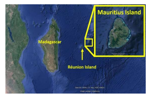
Figure 1. Mauritius Island, Indian Ocean

results was to fully describe contact interactions, confirming the importance of these contacts for this haptic species.